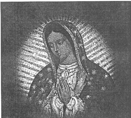
Imagen: Un mosaico de Nuestra Señora de Guadalupe decora un altar lateral de la Iglesia Santa María Regina della Famiglia en Ciudad del Vaticano, 15 de diciembre

TUS ORACIONES SON IMPORTANTES. TUS SACRIFICIOS MARCAN LA DIFERENCIA.