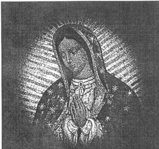
Image: A mosaic of Our Lady of Guadalupe decorates a side altar in the Church of Santa Maria della Famiglia at the Vatican, Dec. 15.

YOUR PRAYERS MATTER. YOUR SACRIFICES MAKE A DIFFERENCE.