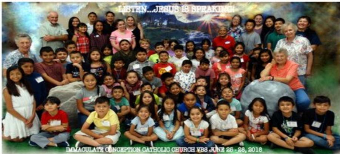
IMMACULATE CONCEPTION CATHOLIC CHURCH VACATION BIBLE SCHOOL JUNE 25 - 28, 2018 CLINTON, NORTH CAROLINA