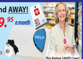
This Button SAVES Lives! As Shown GPS, Lowest Price Guaranteed!